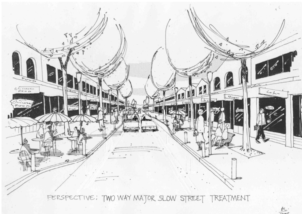
Early sketch of a possible Pedestrian Heart Street