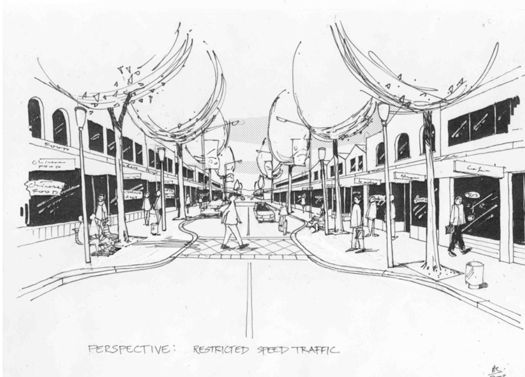
Early sketch of a possible Slow Movement Core Street